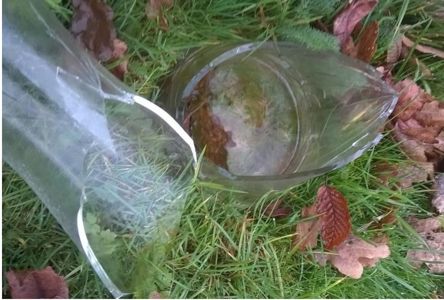
An example of unauthorised, hazardous memorabilia