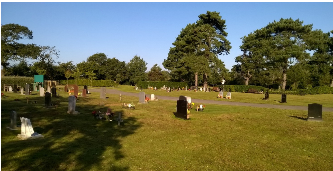
Milford Road Cemetery. An example of an NFDC Cemeteries Lawn Section.